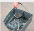
Solution tank: easy to transport and fill