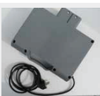
Kit case power supply 230V