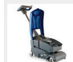
Fast and easy maintenance