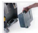
Two types of lithium batteries available (10 Ah and 20 Ah)

The new ultra-compact scrubber dryer Rolly 11 is the right answer to the professional cleaning demand. Comfort in narrow spaces, where no one arrives: - 11 liters of tank capacity, its dimensions, combined with a special handle (patented) and swivel wheels allow Rolly to go and work in small areas. Lithium batteries: a big power in a small case - The last generation lithium batteries hosted in a practical small case guarantees reliability and running time (more than one hour running time with the 10 Ah batteries and more than two hours thanks to the 20 Ah ones). Top cleaning and drying results: - the cylindrical brush deck, with three different down pressure adjustable by knob, against every kind of dirt: - an unbelievable alternate twin squeegee system (patented), for top drying results and optimized consumptions at the same time; - low noise level (only 54 dbA), perfect for day cleaning and in all the environments (hospitals, resthomes, schools...) where silence is a must. A start & go machine No training required, everybody can use Rolly: - all the main functions can be managed by the intuitive control panel; - coloured levers and knobs clearly help the user preparing the machine for work or while using it; - effortless maintenance. Rolly 11 M 33 is available with two different batteries variants (10 Ah, 20 Ah) as standard.