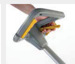
Ergonomic handle with unlocking system