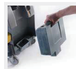
Two types of lithium batteries available (10 Ah and 20 Ah)

The new ultra-compact scrubber dryer Rolly 7 ½ is the right answer to the professional cleaning demand. Comfort in narrow spaces, where no one arrives: - 7.5 liters of tank capacity, its dimensions, combined with a special handle (patented) and swivel wheels allow Rolly to go and work in small areas. Lithium batteries: a big power in a small case - The last generation lithium batteries hosted in a practical small case guarantees reliability and running time (more than one hour running time with the 10 Ah batteries and more than two hours thanks to the 20 Ah ones). Top cleaning and drying results: - the cylindrical brush deck, with three different down pressure adjustable by knob, against every kind of dirt: - an unbelievable alternate twin squeegee system (patented), for top drying results and optimized consumptions at the same time; - low noise level (only 54 dbA), perfect for day cleaning and in all the environments (hospitals, resthomes, schools...) where silence is a must. A start & go machine No training required, everybody can use Rolly: - all the main functions can be managed by the intuitive control panel; - coloured levers and knobs clearly help the user preparing the machine for work or while using it; - effortless maintenance. Rolly 7 ½ M 33 is available with two different batteries variants (10 Ah, 20 Ah) as standard.