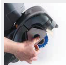
Immediate brush click on/off system (by button)