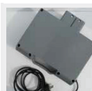
Power supply kit case

The new ultra-compact scrubber dryer Rolly 11 is the right answer to the professional cleaning demand. Comfort in narrow spaces, where no one arrives: - 11 liters of tank capacity, its dimensions, combined with a special handle (patented) and swivel wheels allow Rolly to go and work in small areas. Top cleaning and drying results: - the cylindrical brush deck, with three different down pressure adjustable by knob, against every kind of dirt: - an unbelievable alternate twin squeegee system (patented), for top drying results and optimized consumptions at the same time; - low noise level (only 54 dbA), perfect for day cleaning and in all the environments (hospitals, resthomes, schools...) where silence is a must. A start & go machine No training required, everybody can use Rolly: - all the main functions can be managed by the intuitive control panel; - coloured levers and knobs clearly help the user preparing the machine for work or while using it; - effortless maintenance. Rolly 11 E 33 is the electric version, with a standard power supply kit case and a 15 meters cable.