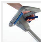
Ergonomic handle with unlocking system

The new ultra-compact scrubber dryer Rolly 7 ½ is the right answer to the professional cleaning demand. Comfort in narrow spaces, where no one arrives: - 7.5 liters of tank capacity, its dimensions, combined with a special handle (patented) and swivel wheels allow Rolly to go and work in small areas. Top cleaning and drying results: - the cylindrical brush deck, with three different down pressure adjustable by knob, against every kind of dirt: - an unbelievable alternate twin squeegee system (patented), for top drying results and optimized consumptions at the same time; - low noise level (only 54 dbA), perfect for day cleaning and in all the environments (hospitals, resthomes, schools...) where silence is a must. A start & go machine No training required, everybody can use Rolly: - all the main functions can be managed by the intuitive control panel; - coloured levers and knobs clearly help the user preparing the machine for work or while using it; - effortless maintenance. Rolly ½ E 33 is the electric version with a standard power supply kit case and a 15 meters cable.