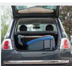
Easy to transport, park, store