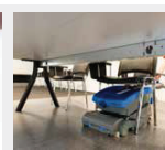
Compact dimensions to go and work where no one arrives